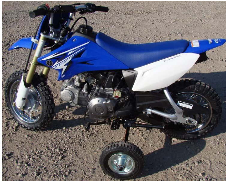
Photo 1 caption: Recalled training wheels mounted on a Yamaha TT-R50